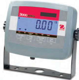
T31P Indicator shown with optional bracket