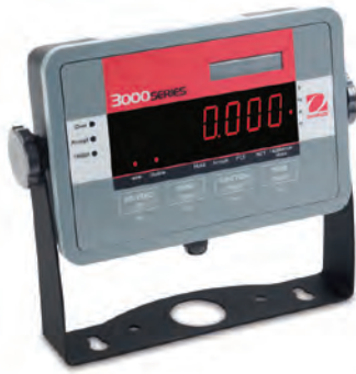
T32ME (LED version)