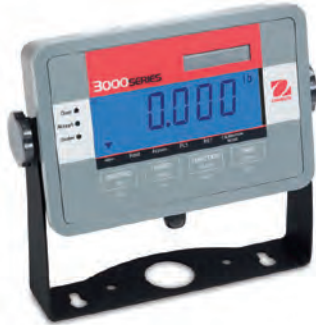
T32MC (LCD version)